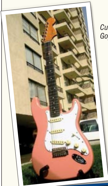
Custom Strat by Goya Luthiers

Available with vintage white, cream, mint and black covers