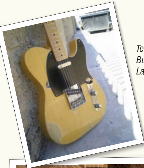
Telecaster by Burton Guitars, Las Vegas Nevada