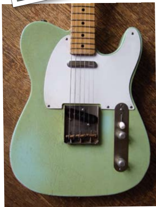
Relic Telecaster by RebelRelic Guitars, Amsterdam